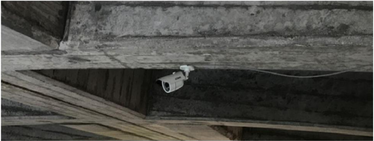
Wireless solar powered cameras used on California and Pennsylvania scour critical bridges.