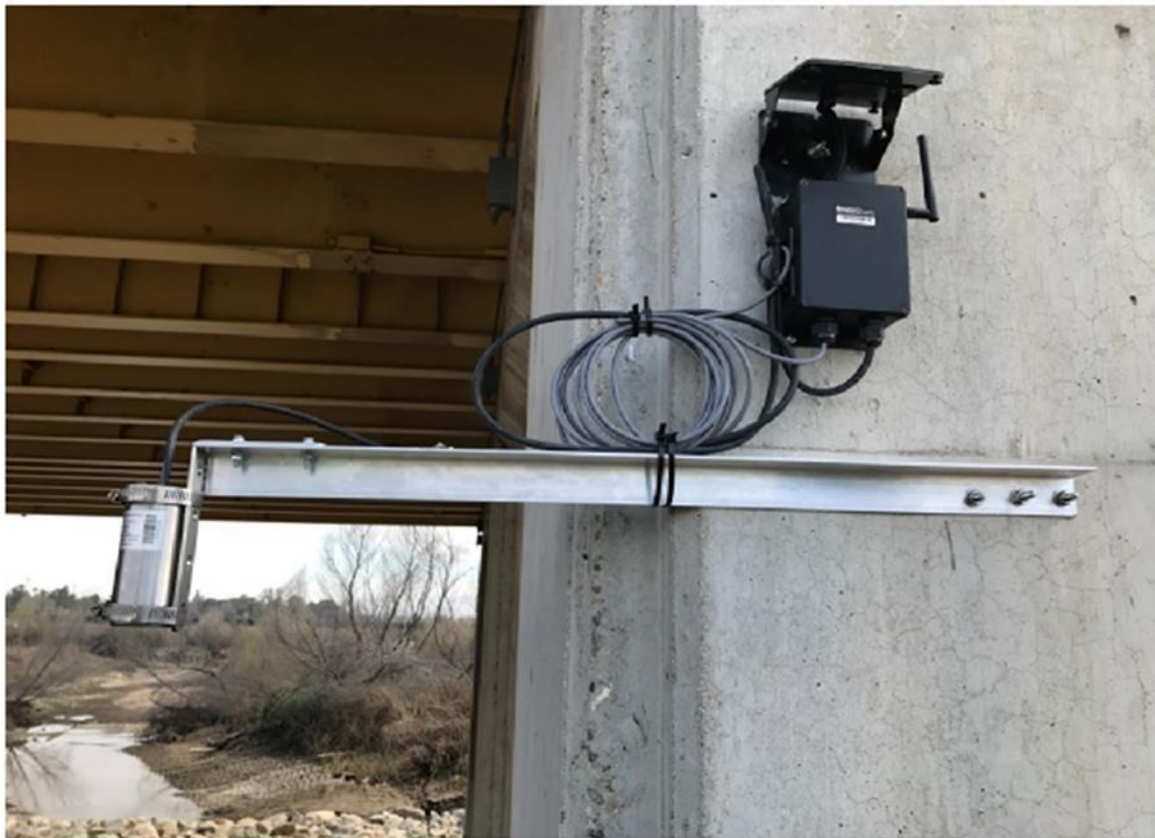
An ultrasonic wireless water level sensor and cameras used for monitoring flood condition on a number of bridges in California